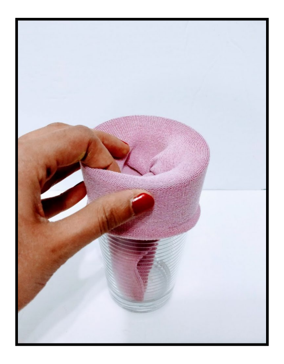
Step 2 Poor the rice into the sock. I used a measuring cup to make it easier to pour, but you can use anything.